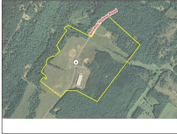
Capon Bridge Tech Park.jpg