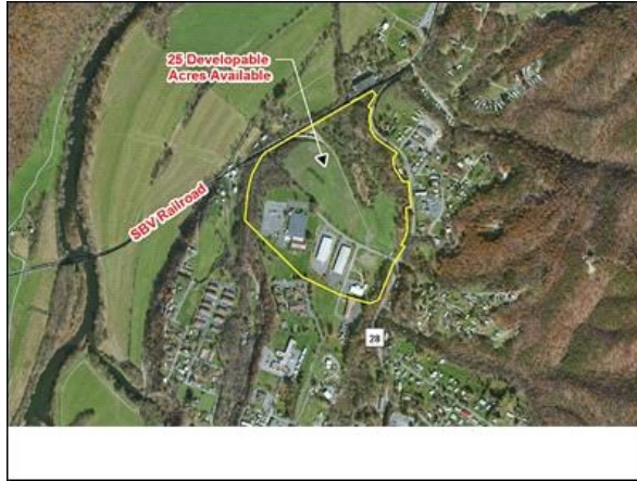
Hampshire County-Romney Business Park.jpg